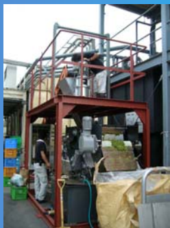
Food shredding and dehydration system

From FOOD WASTE to FEED through our unique FERMENTATION technology